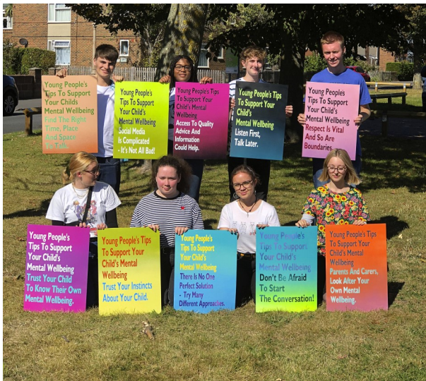
Young people promote the East Sussex Youth Cabinet's 'Top Ten Tips' guide, which helps schools promote positive mental health amongst young people

There will always be children and adults who cannot be looked after at home by their families. Where it is clear this is the case for children, we will intervene early and find permanent or long-term placements for them through fostering or adoption where appropriate. We will also ensure that vulnerable adults are safeguarded whether they are looked after at home or somewhere else.