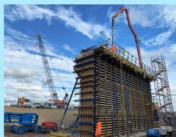
Construction of the Newhaven Port Access Road