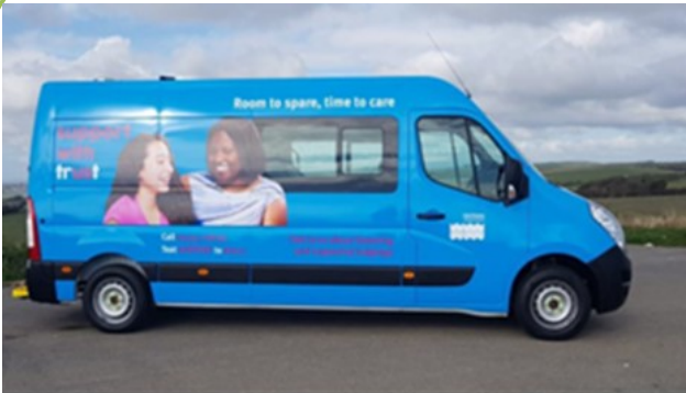
Vinny the Van, which promotes fostering around the county