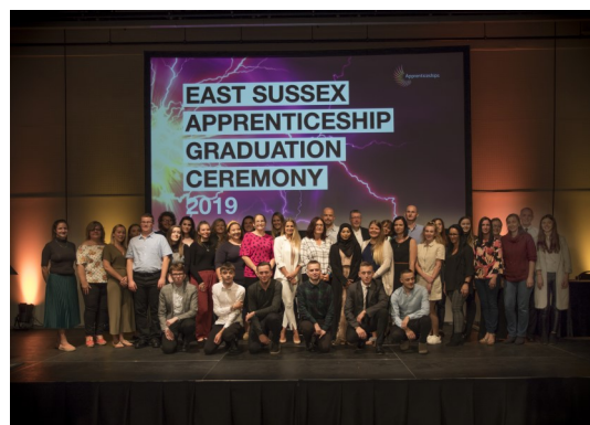
Apprentices across East Sussex were celebrated at the first ever East Sussex graduation ceremony