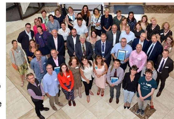
Careers Hub partners celebrate the first year of the hub